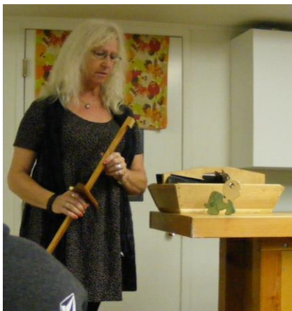
She had a tool/parts tote, a shop made panel gage, a #6